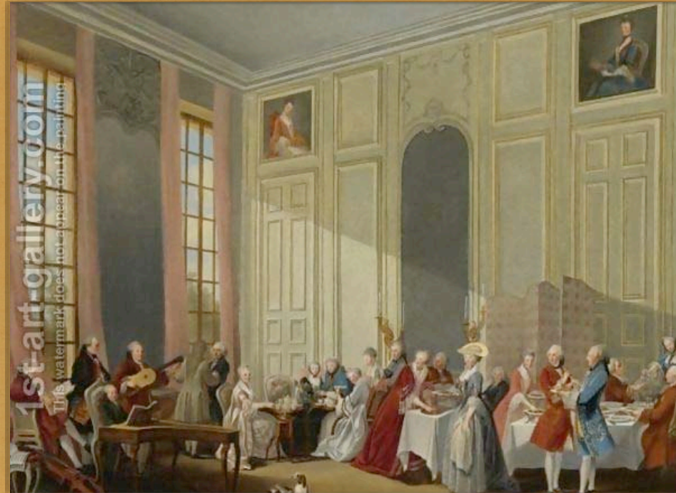
MOZART GIVING A CONCERT